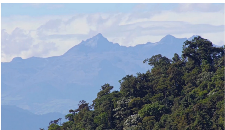
Los Cedros Biological Reserve.

One of the protected areas conceded to Australian mining companies is the Los Cedros Biological Reserve which was set up with the help of the Australian Rainforest Information Centre almost 30 years ago, along with a substantial grant from AusAID.