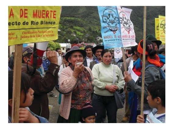
2016 protests against the Rio Blanco mine by local farmers and indigenous communities

Mining represents a short-term investment with great long-term costs to the people of Ecuador. We cannot maintain the illusion that mining can be done without grave ecological and human health consequences, consequences that are well documented in scientific literature.