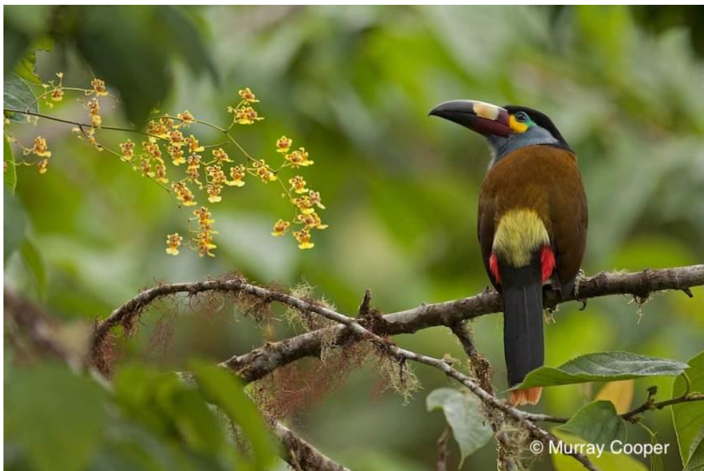
Figure 1: Plate-billed Mountain Toucan. Image credit: Murray Cooper. Please contact for image without watermark